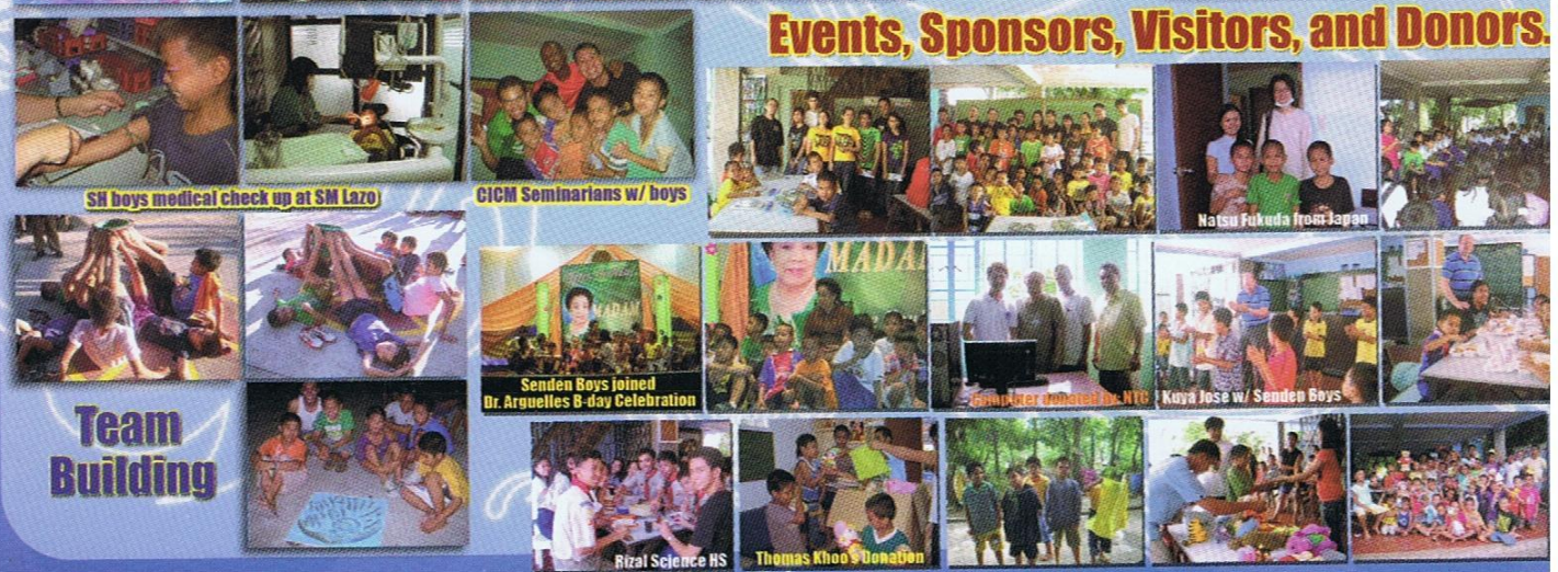
SH boys medical check up at SM Lazo